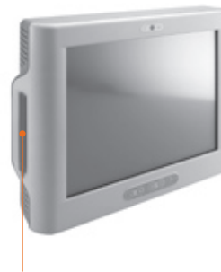
Compact CD-ROM drive